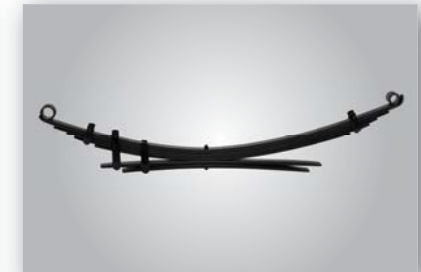
Front & Rear Leaf Spring