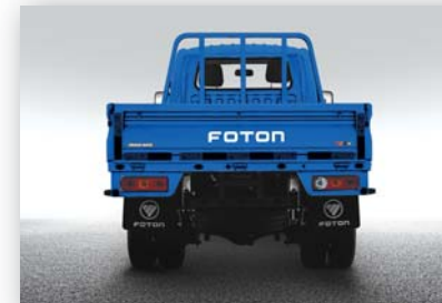
Rear 6 Wheels