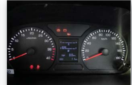
Colorful Digital LCD Dashboard