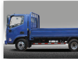
Cabin with modern styling