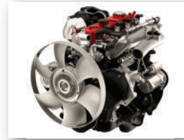
ISUZU Tech Engine