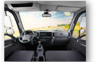
Power Steering and Modern Cabin